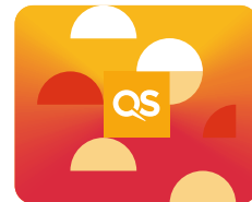
QS Higher Ed Summit: Americas 2-3 October | Hilton Buenos Aires, Argentina