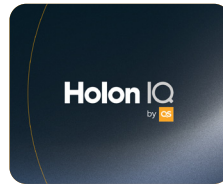
Global Skills Week 24-28 March | Washington D.C., USA