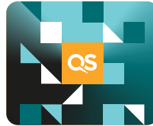
EduData Summit 4-5 June | Singapore