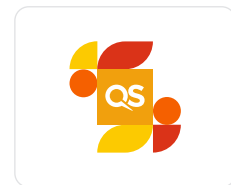
QS Eurasia Forum 25 November | Uzbekistan