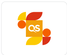
QS Africa Forum 3-4 July | Zanzibar, Africa