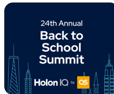
Back to School Summit 10-11 September | New York, USA