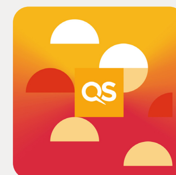
QS Higher Ed Summit: Americas 2-3 Oct | Buenos Aires, Argentina qshesummits.com/americas