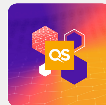
QS Reimagine Education Awards & Conference 1-3 Dec | London, UK reimagine-education.com