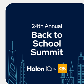
Back to School Summit 10-11 Sep | New York, USA holoniq.com/back-to-school-summit/24th-annual-back-to-school-summit-new-york