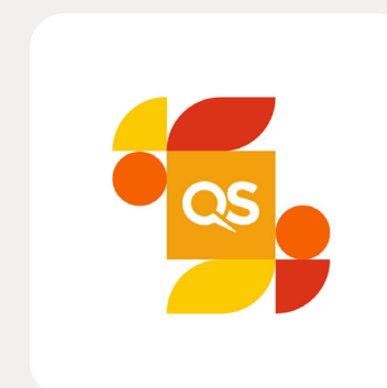
QS Central Asia Forum 10 Dec | Uzbekistan insights.qs.com/registerqscentralasiaforum2025