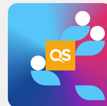
QS Higher Ed Summit: Europe 16-17 Jun | Porto, Portugal qshesummits.com/europe