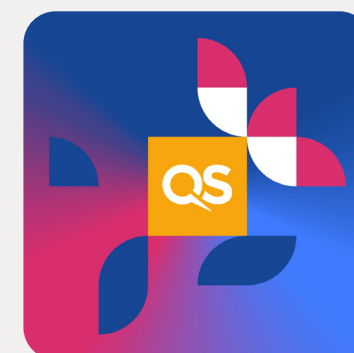
QS Higher Ed Summit: Asia Pacific 4-6 Nov | Seoul, South Korea qshesummits.com/asia-pacific